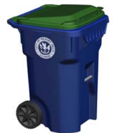
Bi-weekly recycling toter

The TOTERS are coming! The TOTERS are coming!